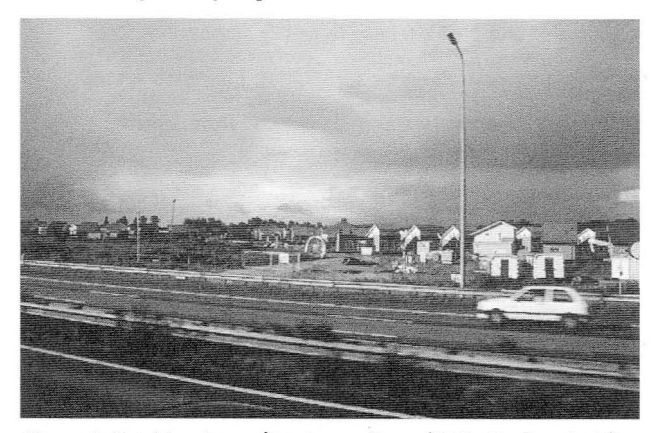
Figure 2. Total Landscape/Landscape Three (© Martin Prominski).

ago, caused by industrialization and modernization. Fossil fuels allowed mass production of goods as well as their easy transport, which led to an increasing homogenization of elements in the landscape. In our modern age, prefabricated houses, shopping malls, industrial estates, petrol stations, farms, roads, etc look roughly the same everywhere. Today, these processes of industrialization and modernization have spread throughout urban and rural landscapes to an extent that Sieferle is only able to identify a single, remaining homogeneous landscape type - the 'Total Landscape'. One result of this assessment is the impossibility of distinguishing between the city and countryside: 'The contrast between cities and the countryside has been of constitutive importance for agrarian civilization. This contrast is now dissolving and to some extent, this classical relationship between the city and the countryside, of urbanity and provinciality turns into the opposite...The city is quiet, the countryside is loud...The countryside is busy, pragmatic and lacks tradition; the city is tranquil, sluggish and takes care of its monuments. Ultimately, the city is environmentally conscious, while the country hates nature and tries to root it out wherever possible'. (Sieferle, 1997, p192f). Thus, Sieferle sees the entire landscape as an artificial system - even nature reserves are constructions because they totally depend on human decisions and care.