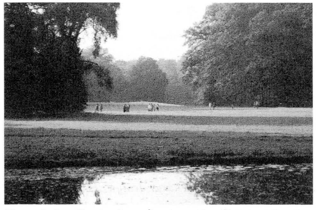
Figure 1. Arcadian Landscape/Landscape Two (© Helmut Rippl).

There are still attempts to re-cultivate open-mining pits back to a pristine, pastoral appearance, or to concentrate wind power masts in areas that would leave as much landscape as possible untouched by these technological invaders - but facing the sheer quantity of technological elements in our contemporary landscapes, these efforts are only of marginal use. Arcadian landscapes might be relevant at specific locations, e.g. in tourist areas dependent on 'unspoiled' scenery or as preservable historic monuments like Central Park in New York, the Tiergarten in Berlin or the Bürgerpark in Bremen. Yet, for the design of contemporary landscapes, the monopoly of this landscape concept must be replaced by new approaches.