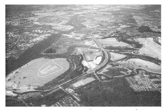
Figure 12. Lifescape, perspective.

Three general themes which may have relevance for a design theory addressing evolutionary aspects can be extracted from these three projects presented.