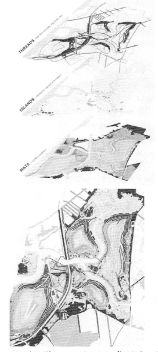
Figures 10 and 11. Lifescape, matrix and plan.

interdisciplinary team directed by landscape architect James Corner, has a complex open-ended strategy. Fresh Kills is the largest landfill in the world and was closed in 2001, after 50 years of use. Immediately upon closure a design competition (by invitation) was held with 5 interdisciplinary teams. Lifescape was the winning entry and is currently being constructed. The design consists of a matrix of overlaying 'Threads', 'Mats' and 'Clusters' (Figure 10): 'Linear threads direct flows of water, energy and matter